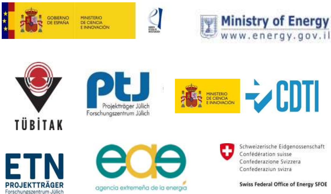
Figure 1: Organisations involved in promoting the CSP ERANET Additional Call and providing support and funding to innovative transnational projects.

The participating national CSP-ERANET partners / contact points are listed in Table 1. Each applicant has to check the project idea with the national contact point as early as possible in the preproposal phase, at the latest before submitting any applications.